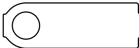
Label original size

The TagPrint TD60 labelling system is positioned behind the clipper and is fixed with the fixing rollers. A communication cable connects the TD60 to the clipper. The labels are fed from the roll into the printing system and printed by thermal transfer. The labels printed on one side run via the label dispenser into the clipping area of the clipper. Then the label is placed into the clip and cut off. The system is controlled via the clipper, or with a separate PLC. The cycle time of the clipper is not reduced by the insertion of the labels.