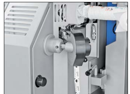
Labels are printed with the printing system and clipped into the exact position via the label dispenser.