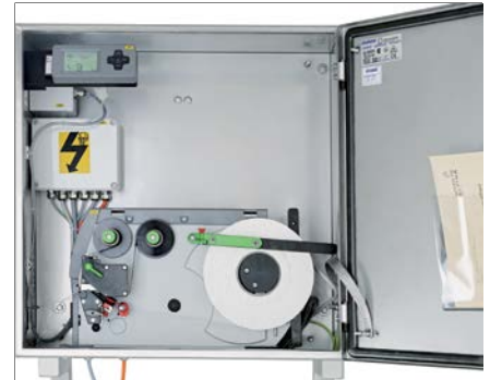
Labels and printing system are installed in a hermetically sealed stainless steel housing.