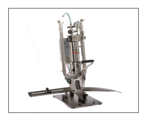
DCM with base plate