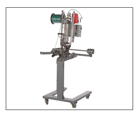
DCM with base trolley