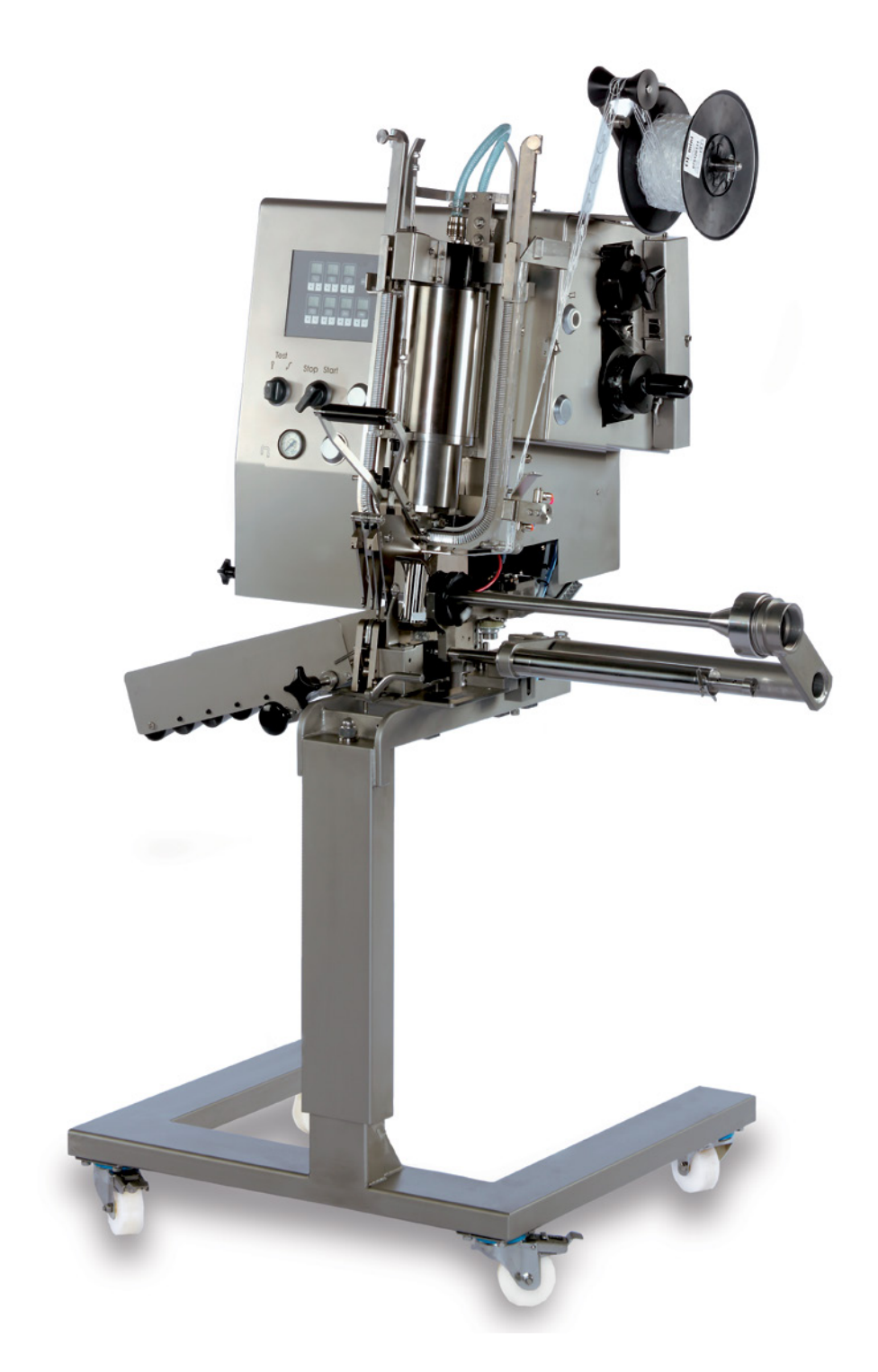
Flexibility, Reliable Performance.