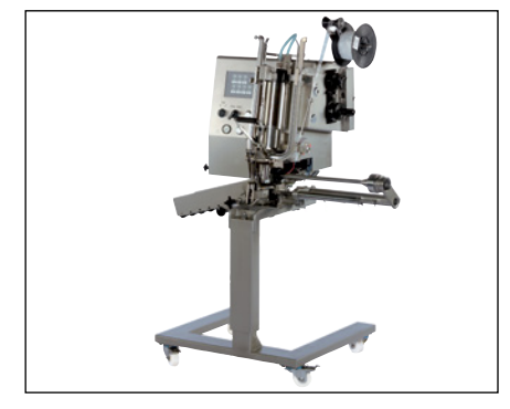
KDCM with electronic control